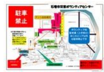
Tent Site Map