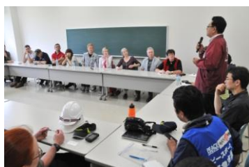
Meeting with the American Chamber of Commerce in Japan