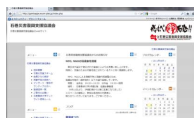
IDRAC Official Website