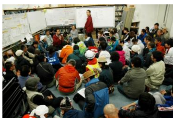
Council General Meeting