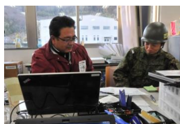
Information Sharing with Self Defense Force