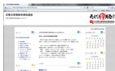
IDRAC Official Website