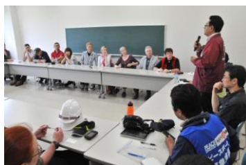
Meeting with the American Chamber of Commerce in Japan